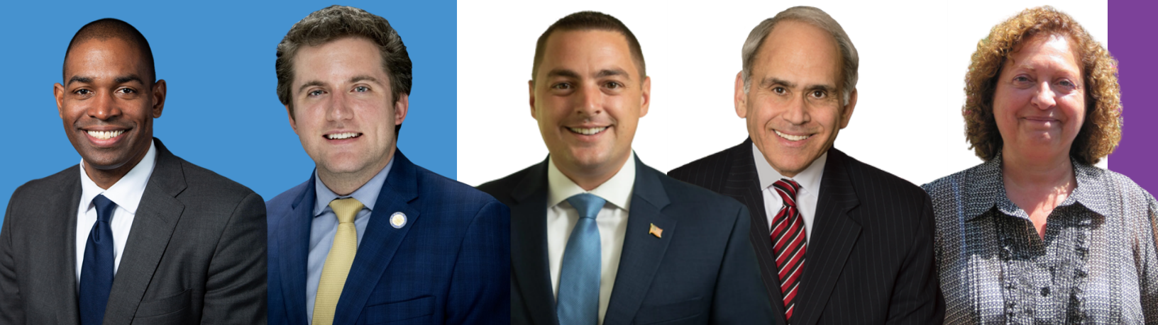
Congressman Antonio Delgado

Check out, listen, and share their SPEAK OUT messages on our Facebook Page @fearlesshv.