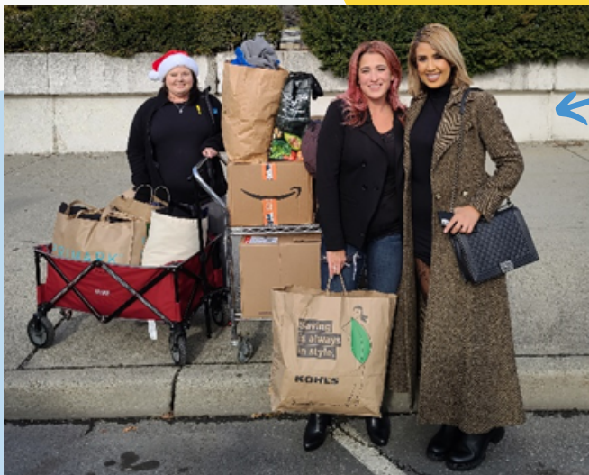
Amal at Cream Newburgh Boutique hosted a coat drive on our behalf.