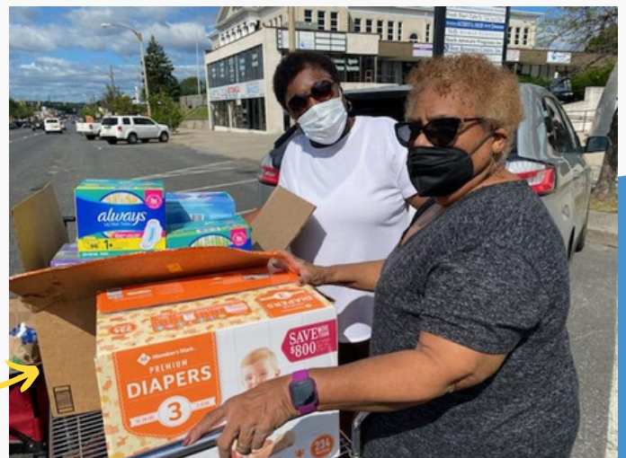
Diaper and menstrual products donation from AME Zion Church of Newburgh