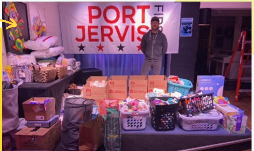
The Shop - Custom Tattoo Studio hosted 'Treat for Treat' at the Upfront Gallery, a night filled with scary fun, spooky art, and ghoulish music all to benefit Fearless! Those who brought items off our wishlist received a gift certificate for their next tattoo.