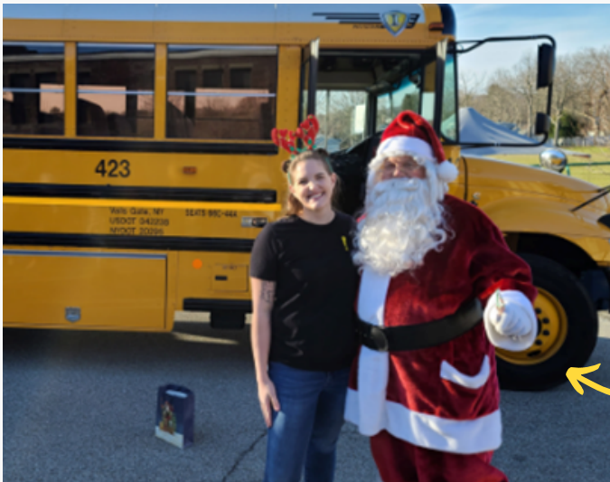
Blessed By Nature & Exquisite Addictions donated Christmas gifts good bags.