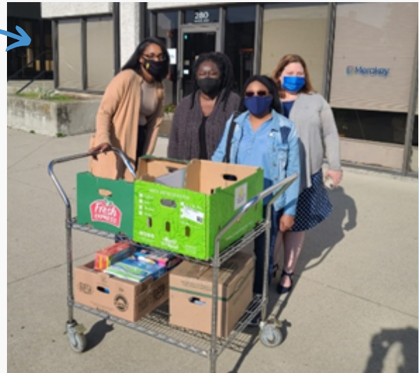
Willow Avenue Elementary School during their PTO Stuff-a-Bus event donated over 300 toys to Fearless!